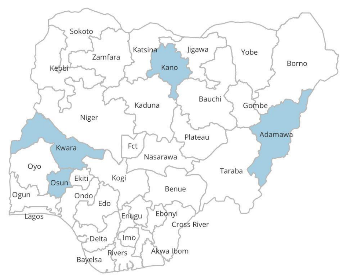
Fig 1: Map of Nigeria showing the three states where geospatial maps were used for microplanning

1. <u>Scope</u>: The NMEP opted to conduct the pilot in Kano State. The state is in the north-western part of the country, with a population of over 15 million people spread across 44 Local Government Areas (LGAs). Thereafter the pilot was further modified based on lessons learned and used in Osun (south-west), Adamawa (north-east) and Kwara (north-central) States.