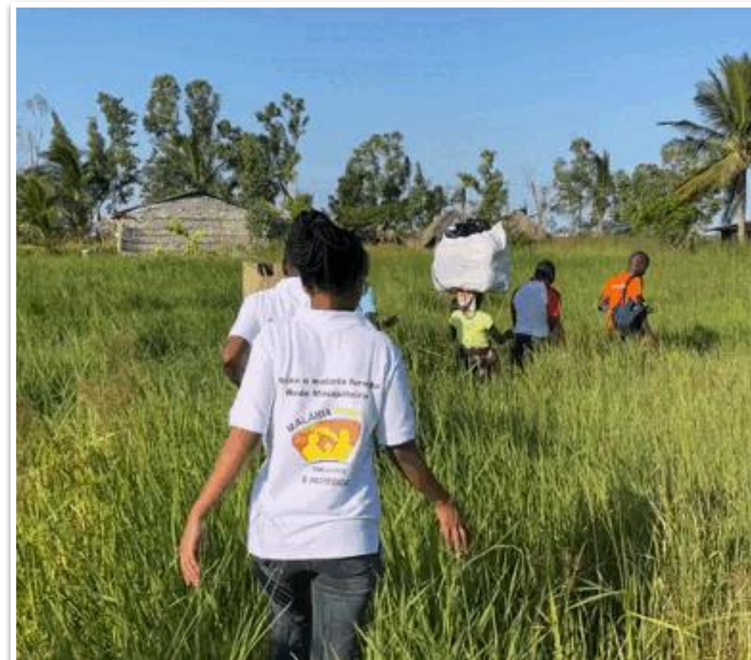
Bed net campaign at Tete