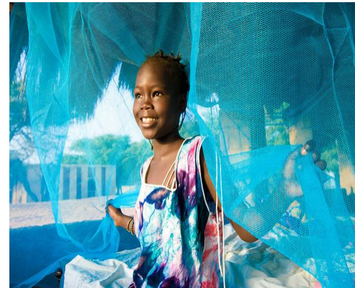
Bed net campaign at Gaza